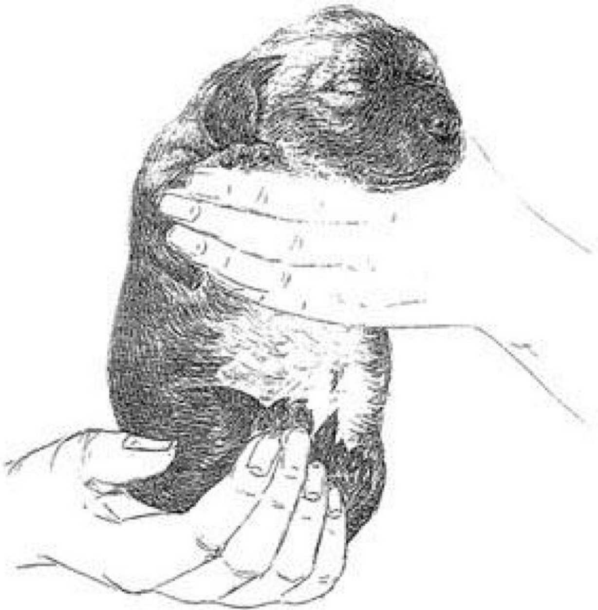
Figure 3 Head pointed down