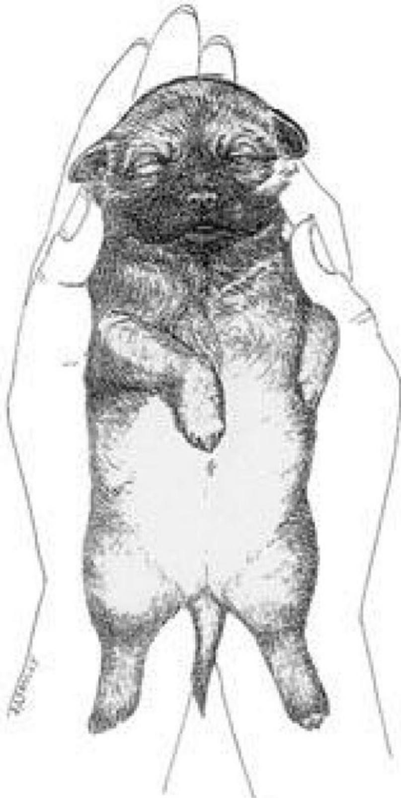
Figure 5 Thermal stimulation