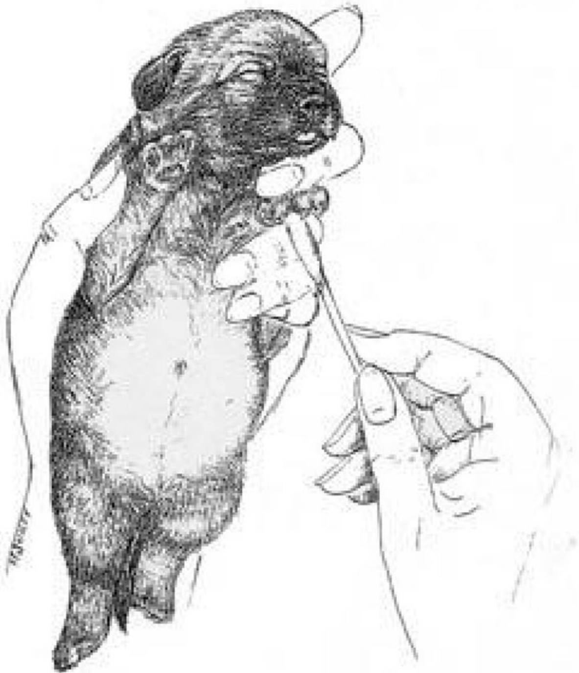
Figure 2 Head held erect